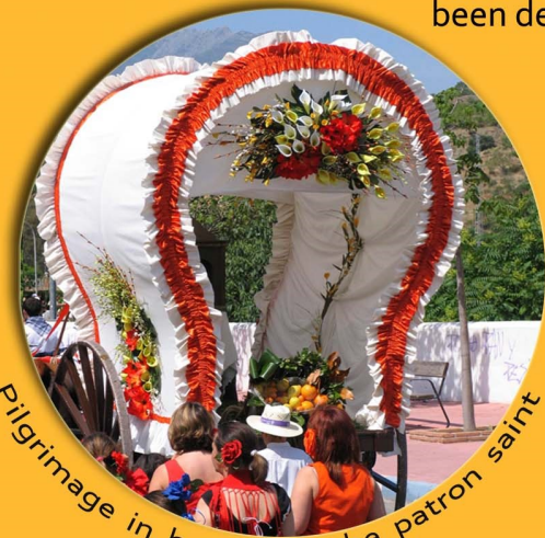
Pilgrimage in honour of the patron saint

It is noteworthy the decorative beauty of the main chapel that is covered by a dome full of decorative plasterworks of Baroque style. The altar is under it and was conceived as an open safe-keeping room and it dates from the XVIII century, whose author was José de Medina. The safe-keeping room has a stairs that surrounds the altar, so that the faithful can get close to the image.